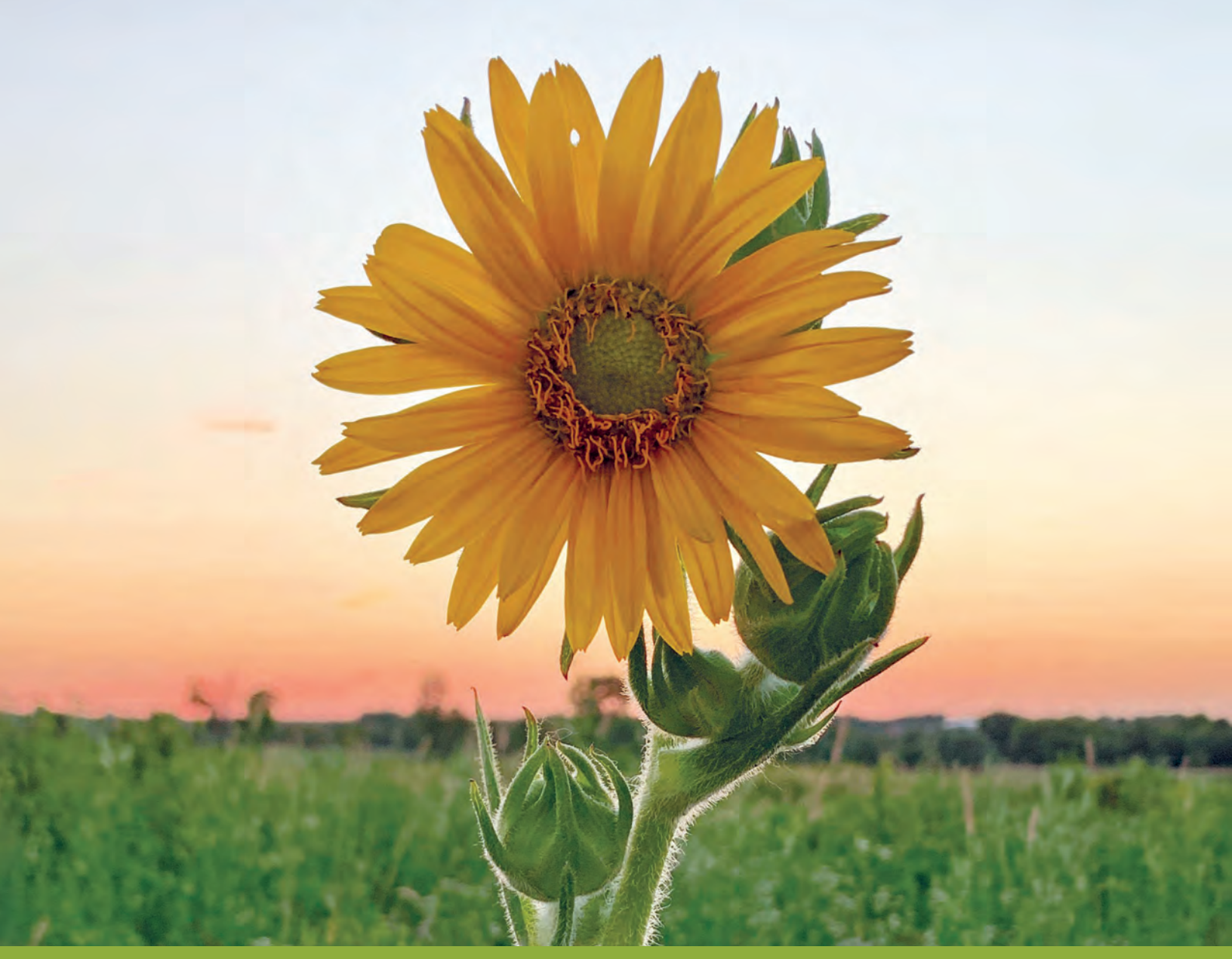
Protecting Land, Plants, and Animals, Together 2023 Year in Review